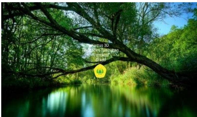
Figure 2. Splash Screen

The implementation of the 3D application was done through data collection, object segmentation, create object texture and create 3D object. The application will start from the splash screen followed by the main menu to select one of the desired plants. Once elected, you will find images by selecting part of good overall, stems, leaves, flowers, or fruit. Even there you will find a description of the plant. As for the plant's own image, because the three-dimensional shape, you can change the size of either enlarged or reduced, or changes the direction of the play, right, left, up, or down. The results that have been made were shown in Figure 2 and Figure 3.