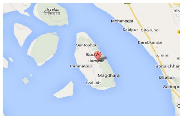
Figure 2. Sky Scenario of Sandwip from Google Map [17]

Sandwip, the eastern side of the delta region, is most approving locations for tidal power application. A flood control barrier exists around the entire island and this contains 28 sluice gates. These barrages and sluice gates can be used for electricity generation. Therefore, the potential of tidal power is very accessible to be applied because the barrages are essential for controlling flow through turbines which is also essential for controlling flood. This invalidates high capital cost for the engineering is already there or is crucial for cyclone protection.