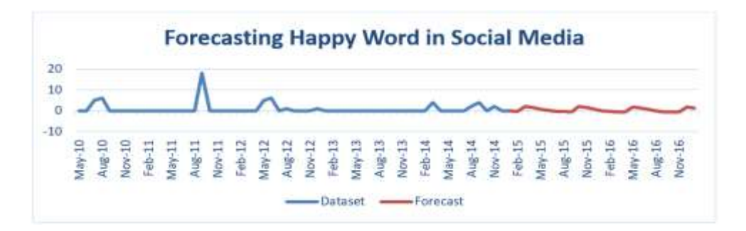
Figure 2. Forecasting happy word

the happy weights achieved by using the TF-IDF of 0.4578818967. So that the forecasting results for inactive users could be seen through the graph in Figure 2.