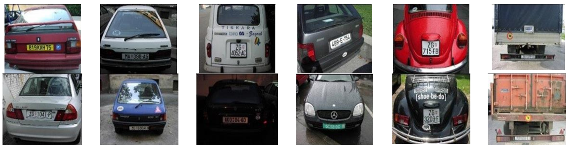
Figure 4. Some sample images that were used in training of the proposed method

The experiments were conducted on MATLAB with a computer having an Intel Xeon E5-1650 v4 CPU and 64 GB memory. A publicly available dataset was used in experiments that contains 502 images [29]. The vehicle images were collected under various environmental conditions such as cloudy day, rainy day and night lighting. The images cover different types of vehicle such as cars, trucks, buses and mini buses. All 502 images were used in training of the proposed approach and for testing procedure, randomly selected 100 images were flipped and rotated in 5 and 10 degrees. While Figure 4 shows some training sample images, Figure 5 shows some test sample images.