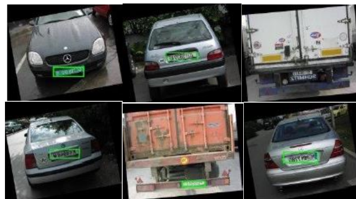
Figure 8. Shows the testing results of the VGG19 model