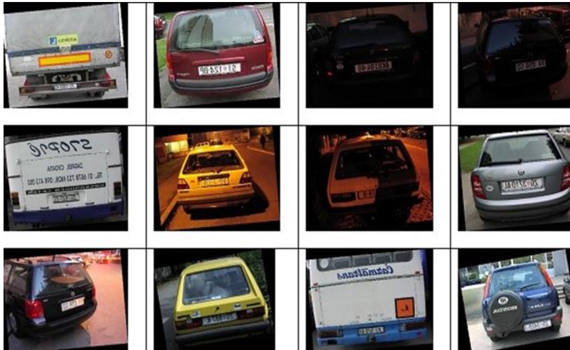
Figure 5. Some sample images that were used in test of the proposed method

As it was mentioned earlier, three pre-trained CNN models were used in Faster RCNN modules. The training parameters of the faster RCNN modules set as following. The stochastic gradient descent with momentum optimizer was utilized in the training process. Maximum epoch, mini-batch size, and initial learning rate were set to 10, 1, and 0.001, respectively. In addition, the positive and negative overlap ranges were scaled to the [0 - 0.3] and [0.6 - 1] ranges, respectively. The number of region proposals to randomly sample from each training image was selected as [256 128]. Box pyramid scale, which was named as anchor box pyramid scale factor, is also 1.2.