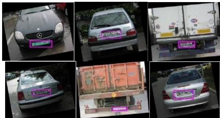
Figure 9. Shows the testing results of the fused model

Table 2 shows the obtained result with individual Faster-RCNN modules and fused result. As seen in Table 2, the AlexNet model produces 74% accuracy score which is the worst among all results. The second worst result 87% is obtained by the VGG19 model. VGG16 model produces 93% accuracy score which is better result than AlexNet and VGG19 models. The Fusing Layer produces the best result which is 97%.