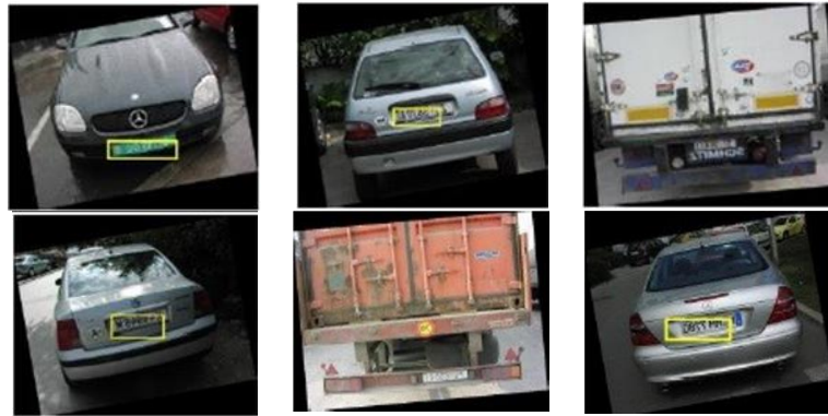
Figure 6. Shows the testing results of the AlexNet model

Figure 7 shows the detection results with “red” rectangles that were obtained with VGG16 based faster RCNN. As seen in Figure 7, all vehicle’s license plate regions were detected correctly by the VGG16 based faster RCNN. Figure 8 also shows the detection results with “green” rectangles for VGG19 based faster RCNN. As seen in Figure 8, except one truck, all other vehicle’s license plate regions were detected correctly by the VGG19 based faster RCNN. Finally, Figure 9 shows the fused results from previous faster RCNN models. The “magenta” color was used for determining the exact location of the license plates for all vehicles. As seen in Figure 9, all vehicles license plate locations were detected correctly.