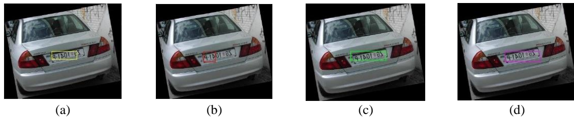
Figure 3. The effect of the fusing layer, (a) The result of Faster RCNN module 1, (b) The result of Faster RCNN module 2, (c) The result of Faster RCNN module 3, (d) The result of fusing layer

VGG16 is another pre-trained deep model which has 13 convolutional layers and 3 fully connected layers. It works very well and has good performance with large datasets, because it uses 3×3 small convolution filters in all layers. The VGG19 model is constructed as a deeper version of the VGG16 model for more performance and better output. It contains 16 convolutional layers and 3 fully connected layers. An illustrative example of the proposed method is given in Figure 3.