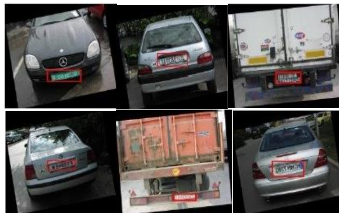
Figure 7. Shows the testing results of the VGG16 model

Figure 7 shows the detection results with “red” rectangles that were obtained with VGG16 based faster RCNN. As seen in Figure 7, all vehicle’s license plate regions were detected correctly by the VGG16 based faster RCNN. Figure 8 also shows the detection results with “green” rectangles for VGG19 based faster RCNN. As seen in Figure 8, except one truck, all other vehicle’s license plate regions were detected correctly by the VGG19 based faster RCNN. Finally, Figure 9 shows the fused results from previous faster RCNN models. The “magenta” color was used for determining the exact location of the license plates for all vehicles. As seen in Figure 9, all vehicles license plate locations were detected correctly.