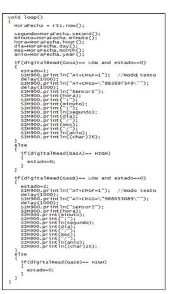
Figure 3. Second segment of the arduino mega programming

The RTC library is defined in the previous figure, which is an extensive family of clock modules that we will use in our project. In this case it is the DS-1307 module. Then we define variables in which we will save data in this case we implement hour, minute, second, day, month. We have a Long variable of name anio since the Arduino source code does not accept the letter ñ. and a Long type variable, since it will store much more memory.