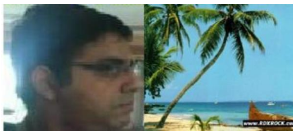
Figure 3(b). Matched output images from the input raw images