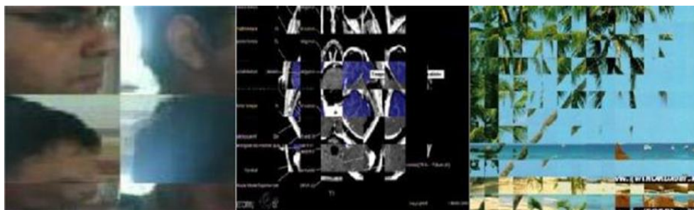
Figure 3(c). Sampled Slice Images with poor conditions

An image-based tracking system can detect the correct position of the moving human face images even poor lightning. Tracking accuracy, processing time and applicability to poor environment is the identical in this method. Consequently, this research improves the performance of the image tracking system to be simplified and not required a separate tracking system. The new algorithm has been implemented is also able to successfully detect the fall event within 255ms. Once the corresponding feature is verified by the current state, it can proceed to next state; otherwise, the system resets to the initial state and waiting for the appearance of another feature sequence. Moreover, a distinguished performance up to 92% on the sensitivity and 99.75% on the specificity is obtained with a set of 450 test activities.