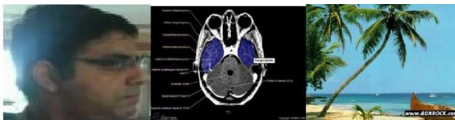
Figure 3(a). Input Images

The textual content turned into hidden inside the video and to protect the data privateness, slicing of video picture has been done. The input frame, sliced frames and the matched photos (i.e. where the question text matched with the hidden text) are proven in Figure 3(a) to parent 3(c). The video frames available for public storage corresponds to the sliced frames and as a result privacy protection is finished. A pattern of the three snap shots, the equal textual content turned into hidden and the corresponding pictures on my own had been correctly recovered.