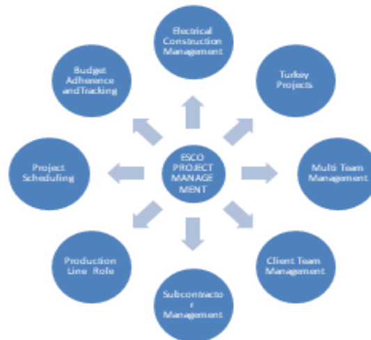
Figure 2. ESCO Proposed Project Cycle

Project management itself is an enduring and iterative process or cycle as shown in Figure 2. The analytical principles of project management can be used throughout the project implementation, not just at the initial planning phase. Even on a project which is progressing satisfactorily, planning and estimating “to completion” is an essential component of managing the project. However, the resultant documentation must never be allowed to become an end in itself. Project management and control systems, planning and other documents, and procedures are no more than tools for achieving that particular project set objectives [10-11]. They prove their value only to the extent that they enable one to manage projects more successfully.