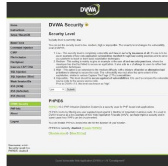
(b) Setting DVWA Security Level