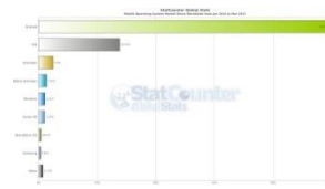
(b) Mobile Operating Systems