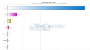
(a) Desktop Operating Systems

Nowadays, computer is considered essential to everyone from young to old, students to the corporates. The number of computer is growing rapidly every year. This rapid growth of number of computer each year leads to the security concern. The computer security is vital because the adversaries are always looking for opportunity and vulnerability to challenge the security. According to [1], security is not just the notion of being free from danger, as it is commonly conceived, but is associated with the presence of an adversary. The presence of adversary who is always seeking to obtain sensitive and private personal information, threat the system, and use it against its legitimate use makes the computer security paramount.