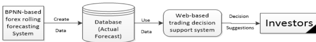
Figure 2. General Integrated Framework for Web

As seen from the research news recommendation is potential field that helped through user’s news interest, filtering and summarization of personalized web news [31]. Same as the forecasting data obtain through decision support system that help by providing investment decision for traders in forex market [32] as shown below in Figure 2 that produced by BPNNFRFS.