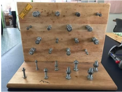
Figure 1. Nuts and Bolts