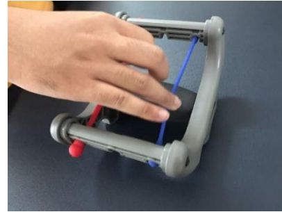
Figure 2. Thera-Band