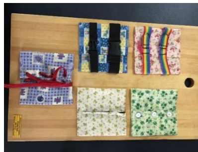
Figure 3. Dressing Board

These fine motor exercises using the gadgets shown in Figures 1, 2, and 3 could help the stroke survivors to strengthen their fine motor muscles so that they are able to grab and hold a pen before learning to write again. Pen and paper method is used for handwriting rehabilitation in this rehabilitation center.