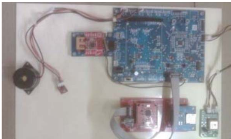
Figure 2. Prototype for Dashcam