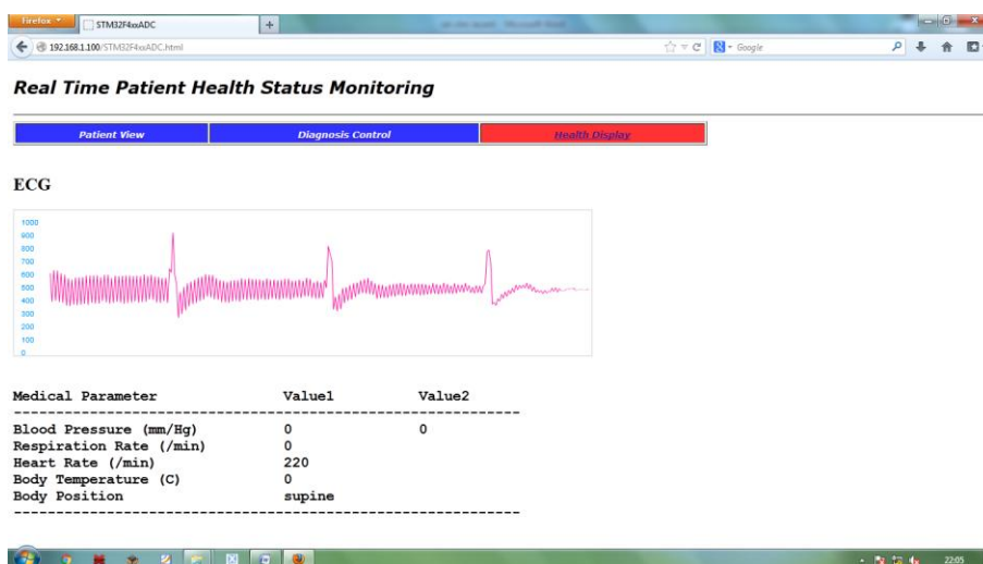
Figure 2. Real-Time Patient Health Status