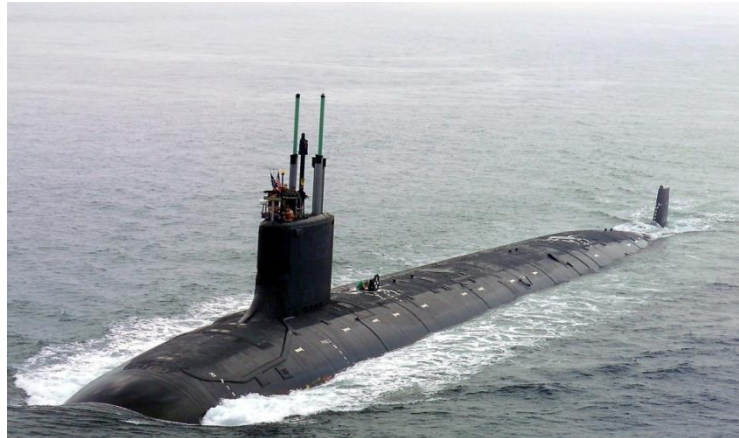
Figure 2. Remote Sensing Image