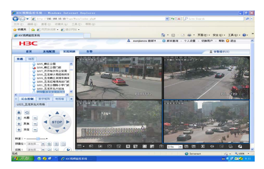
Figure 4. Real-time Monitoring

To show a flexible and practical real-time monitoring function, the user can view multiple cameras filming scenes in multiple panes at the same time.