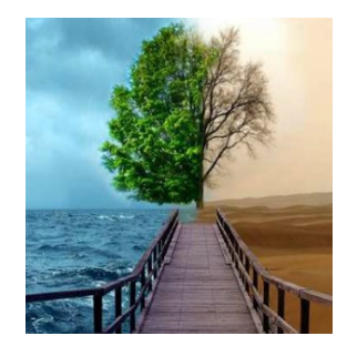
Figure 3. Original image segmentation

process the image color clustering segmentation. Figure 3 is the selected color Landscape.