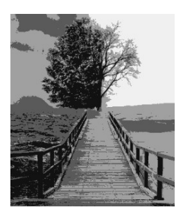
Figure 4. Image gray value segmentation results