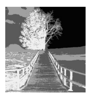
Figure 5. Image segmentation results

Figure 4 is image gray value segmentation map through effective clustering algorithm gray pixels split. From it, we can see that the outline of gray pixels is obvious which proves the effectiveness of the clustering algorithm [17].