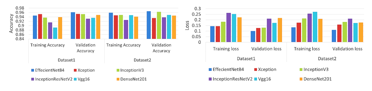
Figure 2. Training and validation accuracy comparison for two datasets

Training time is an important aspect of training deep learning models. The reason for using the transfer learning models is to reduce the cost of training. The training time of the models used in this study has been observed. In Table 2, the average latency per step of the models on two datasets is given. From the table, it is apparent that VGG16, DenseNet201, and EffecientNetB4 have taken lesser time to train than other models. Xception has taken almost 15 seconds per step to train which is the slowest among the six pre-trained models.