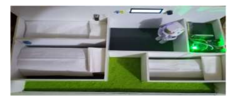
Figure 6. The implementation of sytem

The previous figure shows the heat of patient is 36.6°C, while the room temperature with humidity is 25.00°C and 52.0 respectively. In abnormal cases, patients with COVID19 suffer from high fever, thus if the medical intervention is not done in proper time, the heat will lead to other health problems such as shortness of breath. Therefore, it is necessary to monitor and measure the heat constantly. For example, when the heat of patient rise into 40.4°C as shown in Figure 8, the system works on display the collected data on the LCD monitor at the same time sends an alert to the health workforce. The alert represents blue light with alarm bell to treat the patient as quickly as possible.