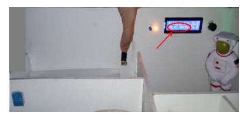
Figure 9. Implementation of system with abnormal case (2)

Also monitoring, controlling, and maintaining humidity is important because it can help to propagate viruses and bacteria. Therefore, if the humidity degree > 69.0 (threshold value) then the sensor will provide a signal to Arduino and an alarm will appear, otherwise, if the humidity degree <= 69.0 then nothing happens. Figure 10 shows increase humidity to 70.0.