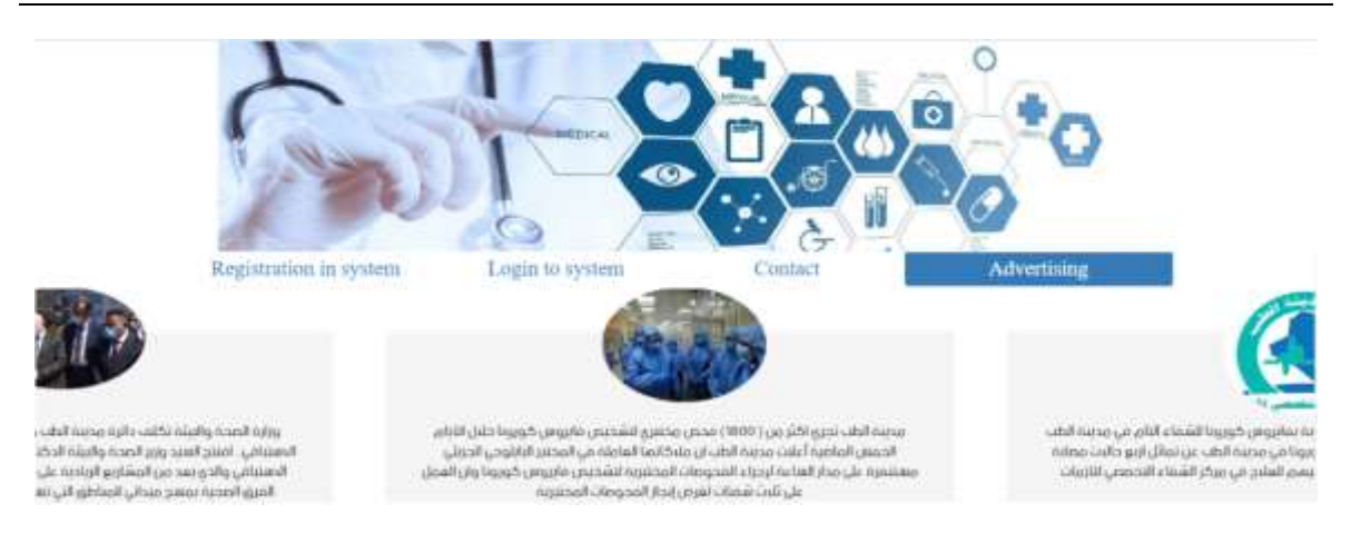
Figure 5. Main page of medical application