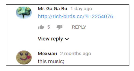
Figure 1. Example of spam and ham comments posted on YouTube

Figure 1 shows example of spam and ham comments posted on YouTube.