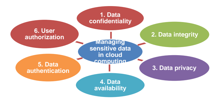
Figure 2. The factors affecting on managing sensitive data in cloud computing

Availability refers to the migrated resources, such as data or applications, being reachable when needed and the cloud service being obtainable as per the agreement [9]. Authentication is a service for the classification of user accounts and data file. It performs setup an account, saving, storing, delete and manage individual user account and data file [8]. Other measures are such as authorization and access control [27].